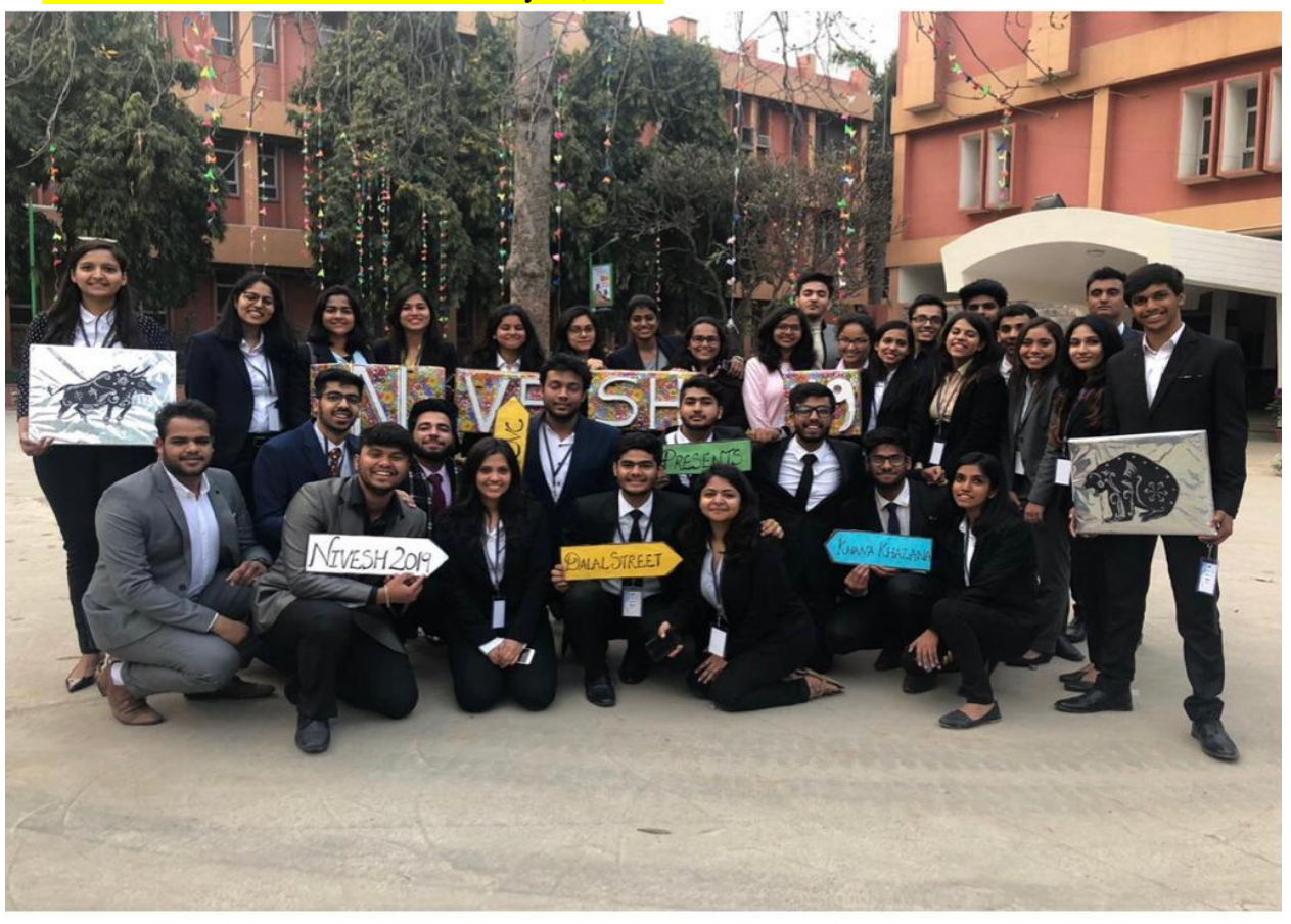
Attendance Sheet of the students for the event on dated 17 February, 2021

• Photos of the event on dated February 17, 2021